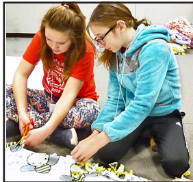
Making "Blanket Buddies" at last year's event